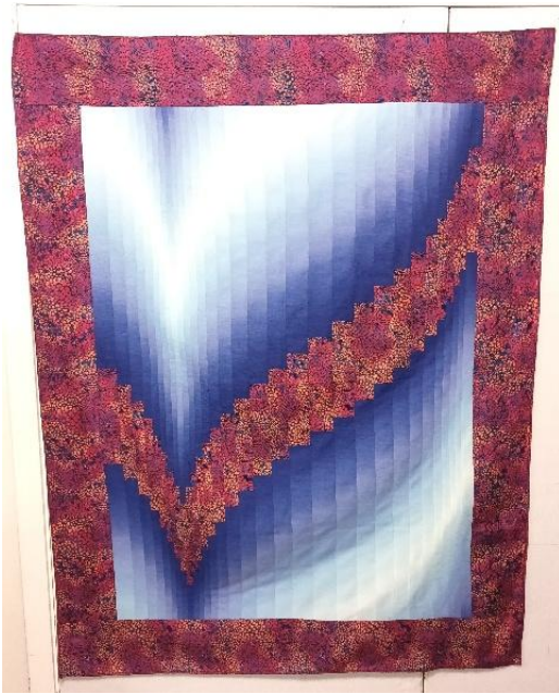
OMBRE BARGELLO (light -dark-light)