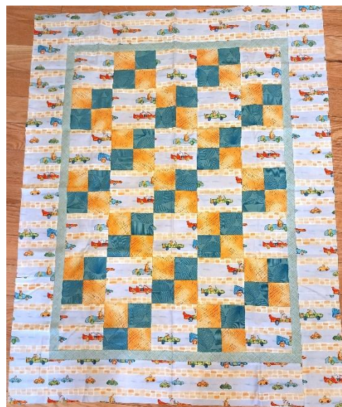
Warm Welcome Quilt