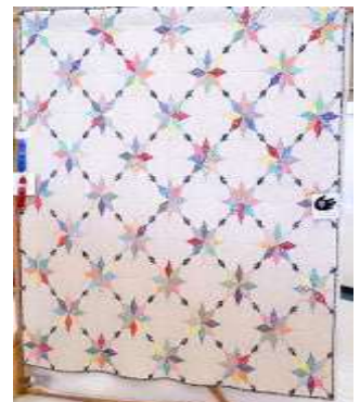
Dee Goodrich Wandering Star Second Place Bed quilt, pattern or adapted pattern, hand-quilted. Best Hand Quilting