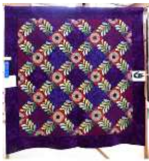
Anne Tamer The Color Puzzle Best Use of Color